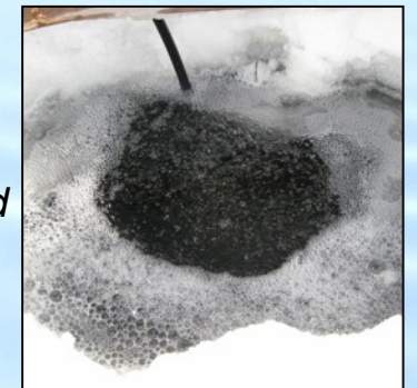
Winter water now